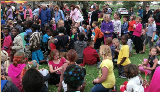
Kids at Christmas Bash calling for Santa

We all left and got home before any rain fell, how was that for timing.