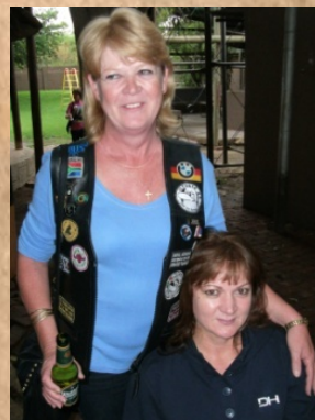
Fin & TopCop Mary-Ann Some Road block tip offs would be great!