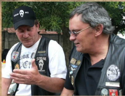
When you reach this lean angle you fall off

We met up with many friends for all the clubs on the West Rand, it felt very much like an exclusive West Rand Rally.