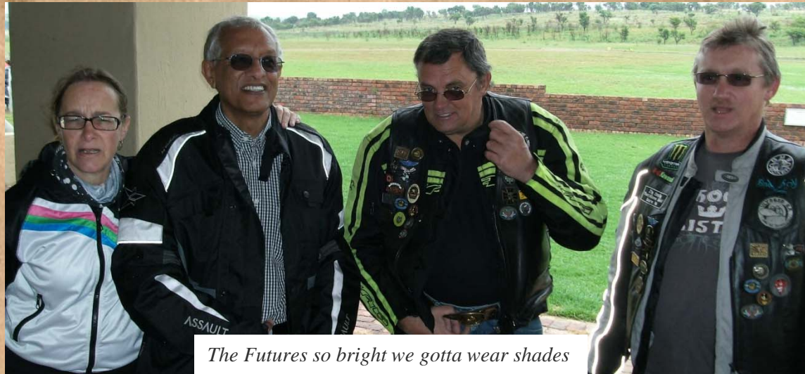
The Futures so bright we gotta wear shades