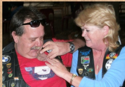
Willie & Fin looking for fleas