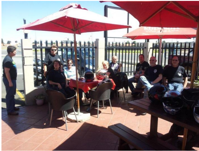
Crew Room, Sunday 23 rd .