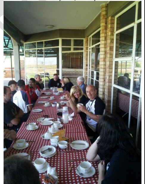
Jockey Club, Sunday 23 rd .