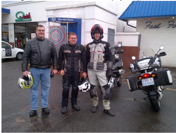
Saturday 22 nd .