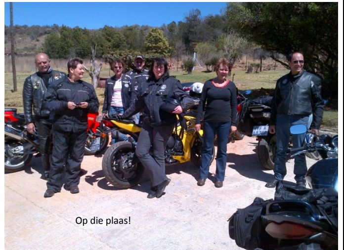
Op die plaas!