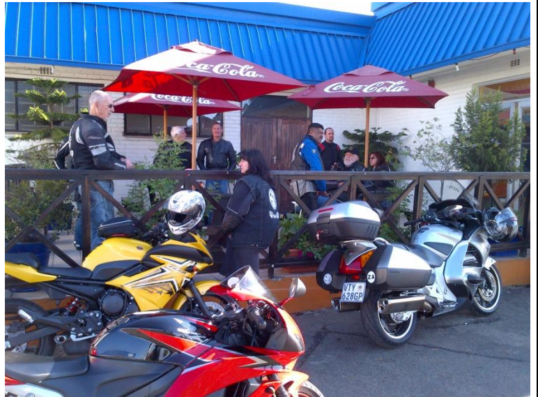
Sunday 23 rd . Crew @ Bimbo's